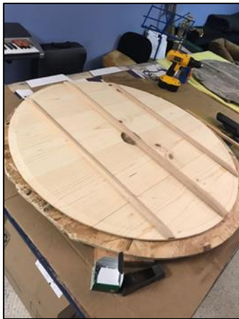
Erik Longo’s Shield Production Studio