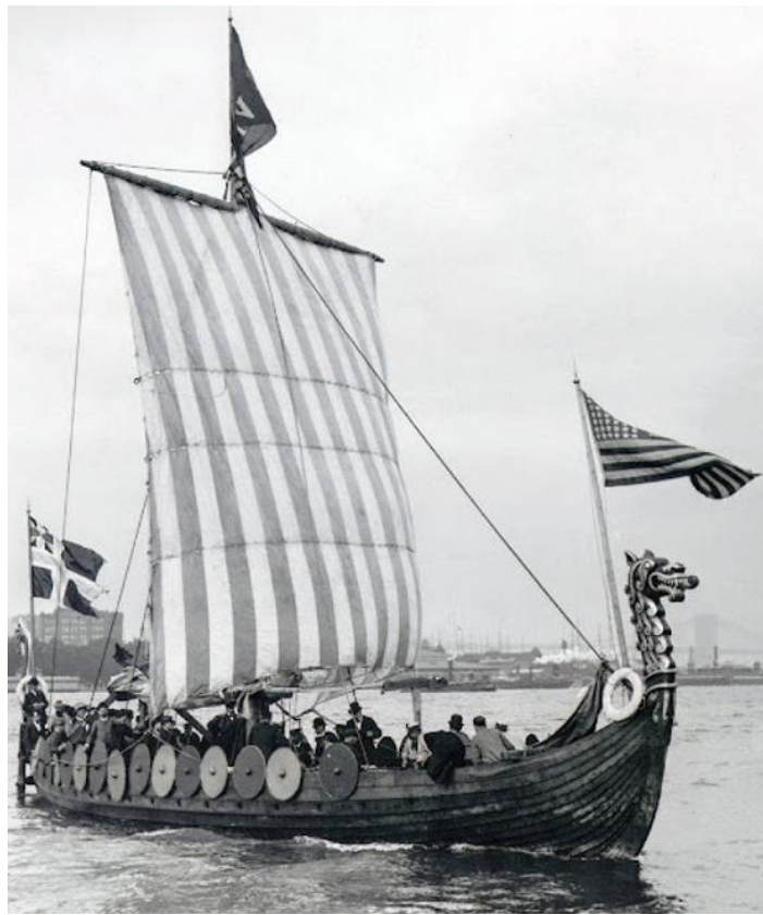
Viking on Arrival in New York in 1893