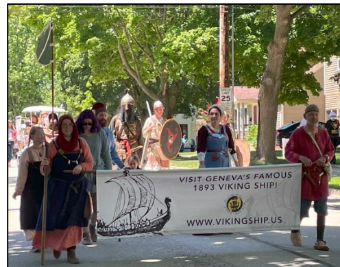
Friends of the Viking Ship walking in the Swedish Days Parade in the City of Geneva, Illinois