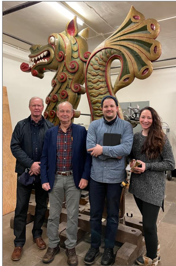
The Re-Discovery of Viking's Dragon Head and Tail at the Chicago Museum of Science and Industry January 2022