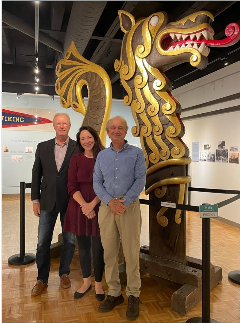
The Fully Restored Dragon Head and Tail Placed at the Geneva History Museum, Geneva, Illinois Ready for the Viking Voyage Exhibition at the Museum January 2023