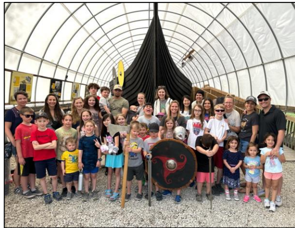
One of the many Private School Groups at the Ship What a Happy Crowd!!